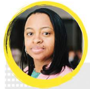
Allandra Bulger Co.act Detroit - Detroit, MI